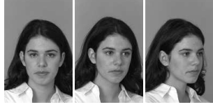
Fig. 2: Example images from the FERET database for 0^\circ , +25^\circ and +60^\circ views (left to right); note that the angles are approximate.